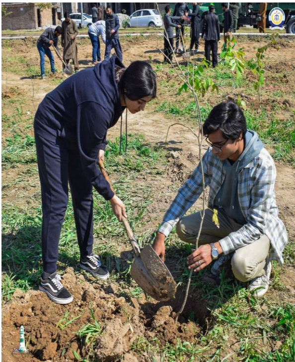
ECO – TOURISM MUBARAK VILLAGE BEACH

On March 9, 2024, Khalida Iqbal Free Education School organized an impressive "Mega Plantation Drive" at D12 Green Belt Service Road West, Islamabad, to welcome the arrival of Spring. KIFES collaborated with volunteers from CSP club at Bahria University Islamabad Campus and CDA Officials for this initiative. The event brought together CSP members, CDA officials, media representatives, and the community, fostering a sense of environmental responsibility. Bahria University's dedicated CSP volunteers, alongside the management of KIFES, planted 250 trees with shovels in hand, promoting a healthier ecosystem for the community and emphasizing environmental responsibility. The day was characterized by teamwork, laughter, and a shared commitment to sustainability.