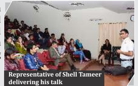
Representative of Shell Tameer delivering his talk

Student Affairs & Career Office of Bahria University organized a session on Shell Tameer program. The session was addressed by Shell Tameer team and attended by faculty members, engineering and business students of last semester. The Program was about promoting a business environment by building entrepreneurial skills in young people.