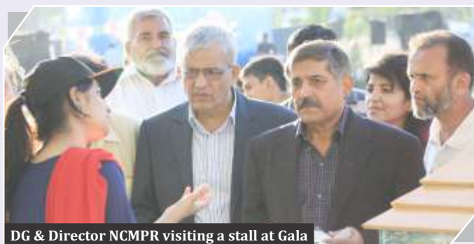
DG & Director NCMPR visiting a stall at Gala

Stalls were setup by NCMPR, WWF, University of Sindh Thatta Campus, Marine Biology Department University of Karachi and representatives of seafood industry. Fish farmers set up stalls with live fish for sale which remain crowded with buyers. A group of fishermen created a scene with people working on fishing equipment like boat, net and fish carrier bag. People of every age and gender were excited to see the life of a fisherman. There were many other activities of fun including haunted house, gaming