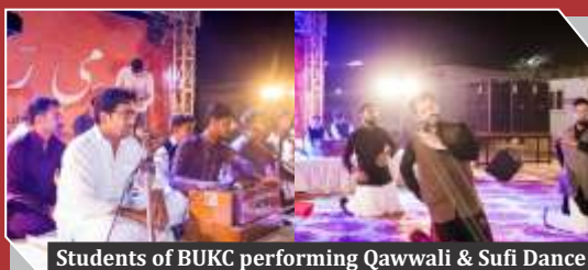
Students of BUKC performing Qawwali & Sufi Dance

On 23rd Dec, 2016 Students of Media Studies Department, Bahria University Karachi Campus organized Mi-Raqsam, a mystical Sufi Night with Qawwali and Sufi Dance performance. The event was