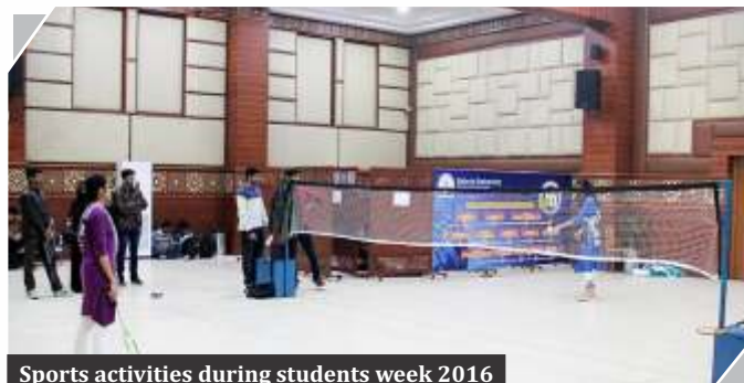
Sports activities during students week 2016

distributed prizes among students who did well in different competitions.