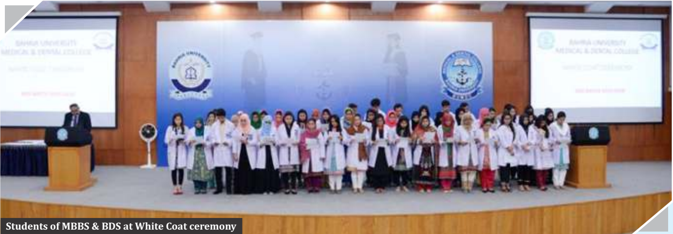
Students of MBBS & BDS at White Coat ceremony