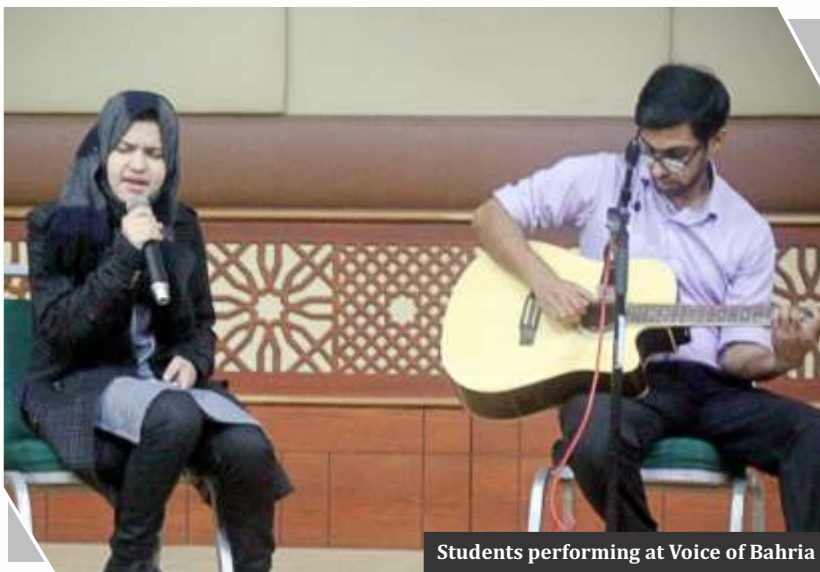
Students performing at Voice of Bahria