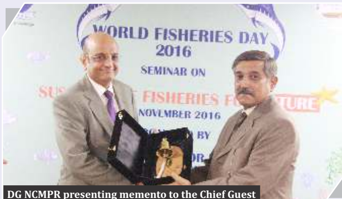
DG NCMPR presenting memento to the Chief Guest