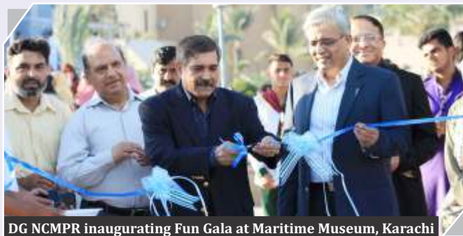
DG NCMPR inaugurating Fun Gala at Maritime Museum, Karachi