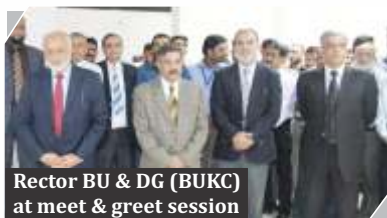
Rector BU & DG (BUKC) at meet & greet session