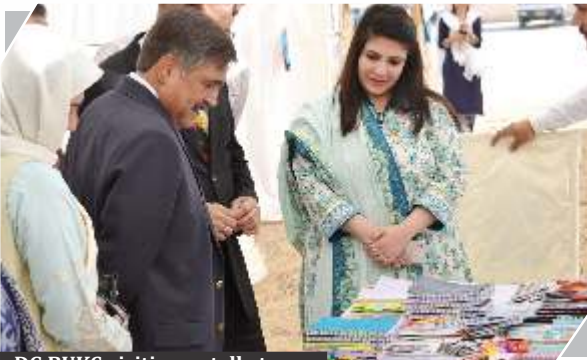
DG BUKC visiting a stall at Mental Health Awareness Camp

On November 16, 2016 a Mental Health Awareness Camp was held at Bahria University for students, faculty and Staff. The camp got an overwhelming response with 1200+ participants. The theme for the camp was "Sky is the Limit" which focused on equipping participants with skills to reach their true potential. There were five separate stalls with titles Khudi, Driving Me Mad, Draw to Know, Self Esteem Mandalas and Stress Managers for assessment of participants. Each stall provided participants with assessment results along with coping interventions to solve their problems.