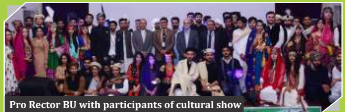
Pro Rector BU with participants of cultural show