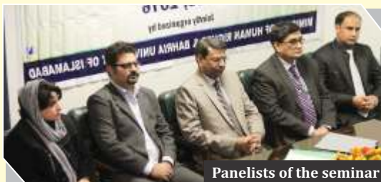
Panelists of the seminar

On 6th December, 2016 Bahria University, Law Department in collaboration with Ministry of Human Rights organized a seminar on “HELPLINE FOR LEGAL ADVICE on HUMAN RIGHTS VIOLATION. The session was aimed to raise awareness on the subject and was attended by representatives of the ministry, faculty members and students.