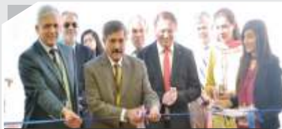
DG (BUKC) inaugurating career expo

Students Support Centre-Bahria University Karachi Campus organized Career Expo 2016 on November 29, 2016. The expo was aimed at providing platform for students to experience the corporate settings and present themselves before various national and multinational organizations for internship and employment opportunities. Over 80 companies attended the Career Expo,