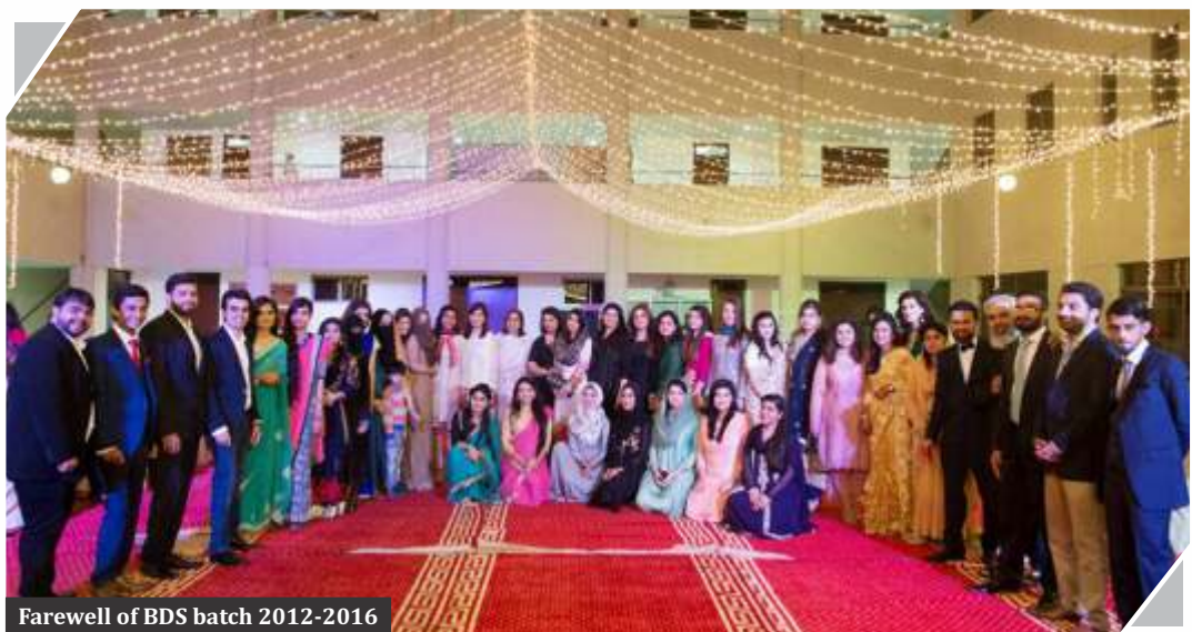
Farewell of BDS batch 2012-2016