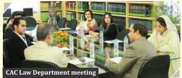
CAC Law Department meeting

Members of Corporate Advisory Committee of the Department of Law met on 25th Nov, 2016. The meeting was convened to seek suggestions and recommendations for curricular and extra-curricular activities to set the programs aligned with existing and emerging needs of the local industry.