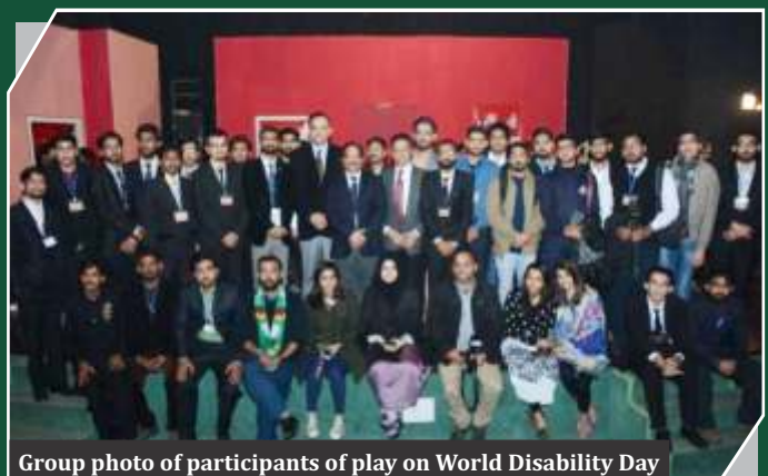
Group photo of participants of play on World Disability Day