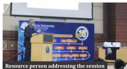
Resource person addressing the session