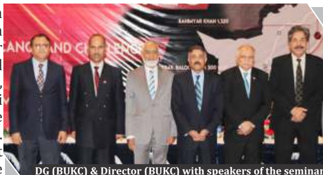
DG (BUKC) & Director (BUKC) with speakers of the seminar