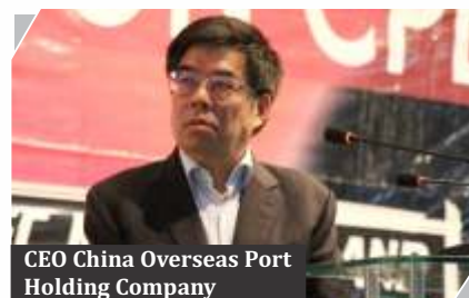
CEO China Overseas Port Holding Company

graced the session as the honorable guest speakers who shared knowledge on the topic. Students also participated and presented a role-play on the Impact of CPEC on the economy of Pakistan.