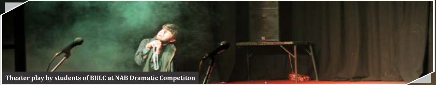
Theater play by students of BULC at NAB Dramatic Competition

On 20 Dec 2016, students of Bahria University Lahore Campus participated in NAB Dramatics Competition at Bukhari Auditorium, Government College University Lahore. Theme of this competition was Anti-corruption. Universities from all over Lahore participated in this competition. BULC's play was titled "Rah e Hal" which told the story of a fake Aamil baba and how he deceives innocent people. The play not only depicted financial corruption but also moral corruption in our society. The performance of BULC's students was appreciated by the audience.