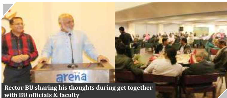
Rector BU sharing his thoughts during get together with BU officials & faculty