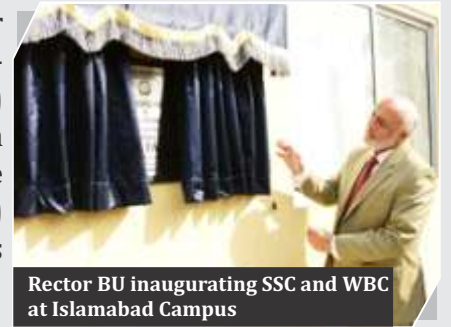
Rector BU inaugurating SSC and WBC at Islamabad Campus