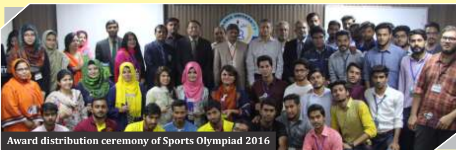
Award distribution ceremony of Sports Olympiad 2016