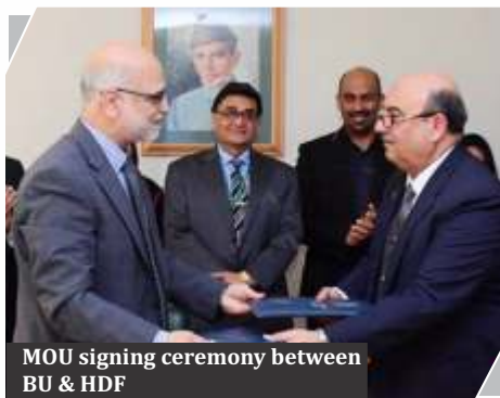
MOU signing ceremony between BU & HDF