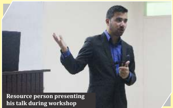
Resource person presenting his talk during workshop

The workshop revolved around how a person can excel through his/her skills. The participants were actively involved in the workshop and were able to relate to its practical nature.