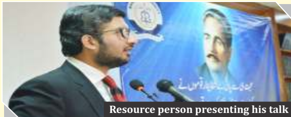
Resource person presenting his talk

On November 30, 2016 Department of Law, Bahria University organized a guest lecture/ dialogue to commemorate the contribution of great poet, philosopher and lawyer, Dr. Allama Muhammad Iqbal. The theme of the session was “IQBAL KA PAIGHAM E MOHABBAT”. The lecture was attended by faculty members, students and BU officials..