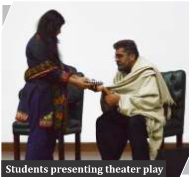
Students presenting theater play

The disability day was celebrated at Bahria University Islamabad Campus on 21st December 2016 to show the empathy towards the special people in the society. To create the awareness among the students of Bahria University, the Arts and Dramatics