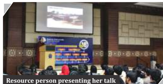
Resource person presenting her talk