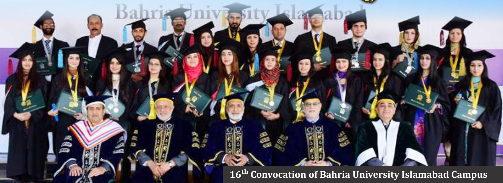
16 th Convocation of Bahria University Islamabad Campus