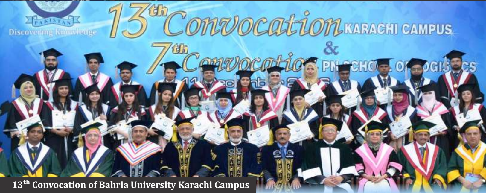
13 th Convocation of Bahria University Karachi Campus