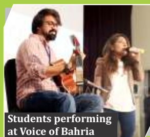
Students performing at Voice of Bahria

provinces of Pakistan. The Celebrations of the Week were ornamented with Cultural show, carnival, sport activities, E-Gaming, theatre, photography competition, Model United Nations, Voice of Bahria and Inter-University Sketch Contest. In additions to these motivational lectures and speeches were also the parts of the activities during week.