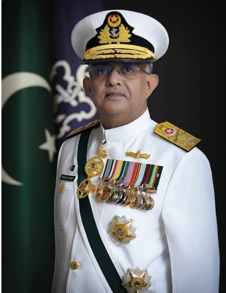
Admiral Naveed Ashraf NI(M) T Bt Chief of the Naval Staff Pro-Chancellor and Chairman BoG Bahria University, Islamabad