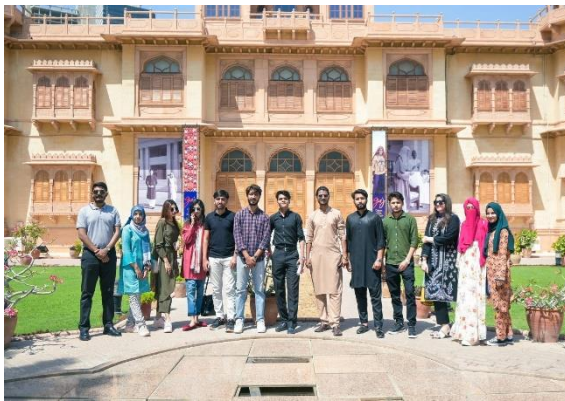
Mohatta Palace Museum Karachi

The Green Youth Movement (GYM) club at Bahria University Karachi Campus recently arranged a field trip focused on eco-tourism. This Eco-tourism trip was held on 29th April 2024 , where our students explored various historical landmarks in Karachi, such as Mohatta Palace, Mazar-e-Quaid, Frere Hall, and the Maritime Museum. The Media Club of BUKC diligently documented these significant sites, capturing their historical essence and promoting cultural appreciation among participants. These historical places of Karachi not only hold significant cultural as well as architectural value, offering visitors glimpse into the city's past. Incorporating these landmarks into eco-tourism initiatives promotes sustainable tourism practices by encouraging exploration of historical sites while minimizing environmental impact, therefore by showcasing the rich heritage of the city Karachi, eco-tourism endeavors not only educate visitors about the city's history but also foster appreciation for conservation efforts and the preservation of cultural treasures for future generations to enjoy.