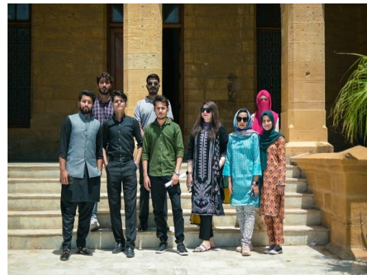
Frere Hall Karachi