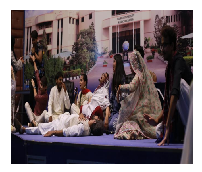
BUDC in Collaboration with EMC X Music Club X Media Club Awareness session May 31, 2023